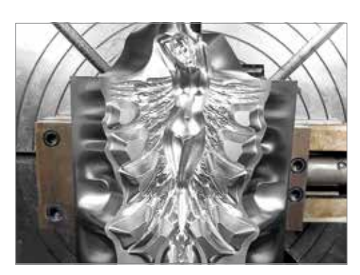
Other molding die made of special cast iron for casting of an exclusive crystal glass sculpture.