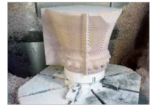
Working area of the Hermle-MC C 30 U with NC swive rotary table (Ø 630 mm) for 5-axis complete machining of demanding prototypes, models and tool segments in 3D form